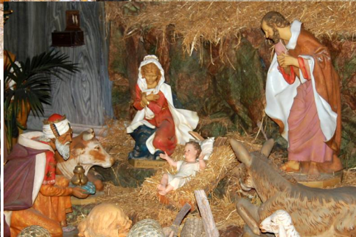
Above is the Scene at Martino in Monte, the Church of St. Gaspar's baptism.