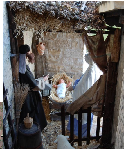
Above, San Damiano in Assisi, To the left is the display at St. Paul in Albano. Below is the Outdoor scene at St. Peter in Rome. At St