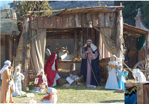
Around the world it is common to put up a Nativity scene either outside or inside the Church. These pictures are from 2006 and show various scenes locally and in Italy. Above is the outside scene in front of the Basilica of St. Francis in Assisi. Below is the display in the I Monachi Restaurant in Assisi.