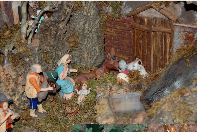
Right, is the Nativity Scene inside the St. Edward Rectory. Below is a detail of a painting at the Angelicum in Rome.